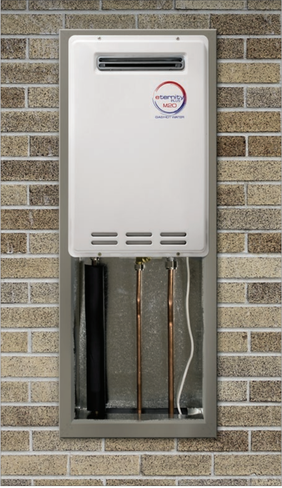
Recess Box Installation with M20 unit (Shown as painted with cover plate removed)